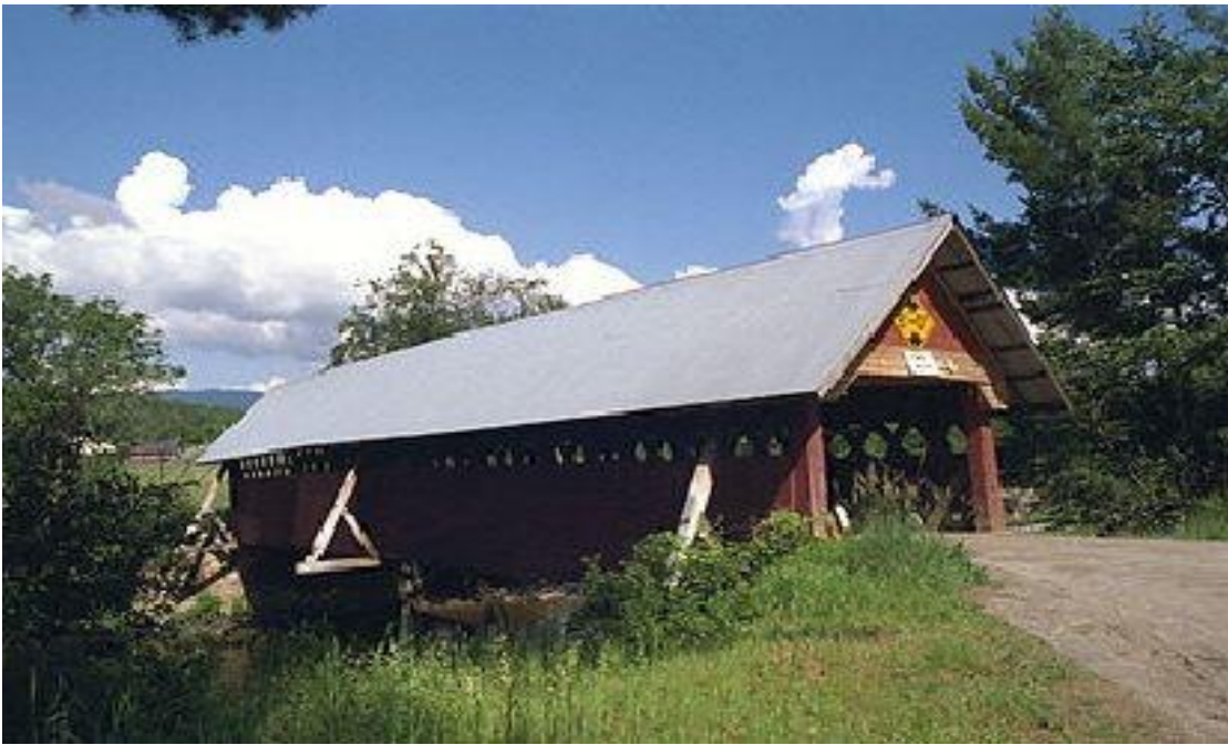
River Road Covered Bridge North Troy, VT 05859