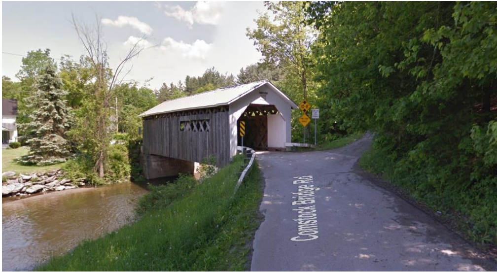
Comstock Covered Bridge Montgomery, VT 05471