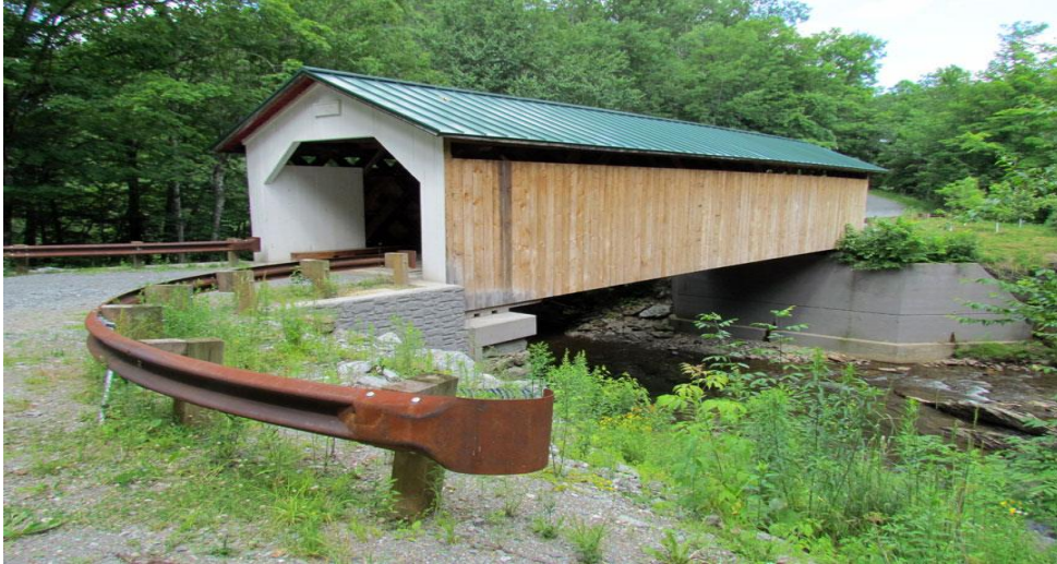
Hutchins Covered Bridge Montgomery, VT 05471